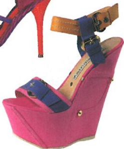
Cerise pink wedges Dhs2,450 Gianmarco Lorenzi