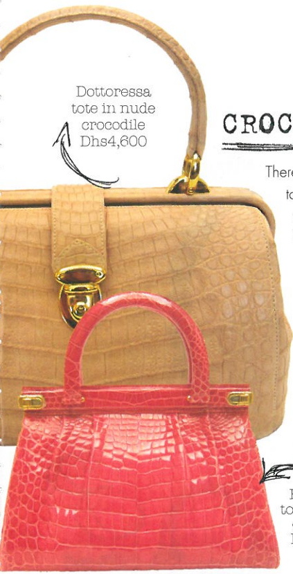
Dottoressa tote in nude crocodile Dhs4,600