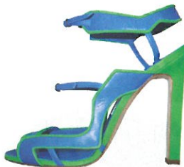
Lime green and blue peep toes Dhs3,650 Manolo Blahnik at Harvey Nichols