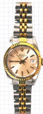
4 Vintage Rolex

"Block colours are a key trend at the moment and I love the opportunity to mix and match bold brights. The dress is fun and floaty, ideal for the Dubai weather, and the gold clutch adds a touch of glamour and sparkle. My accessories are a mix of vintage classics and contemporary pieces which create a diverse and unique look."