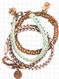
2 Vintage bracelets

"The Dubai-based designer marries the elements of bright colours and flowing fabrics perfectly. Two of my favourite trends in one!"